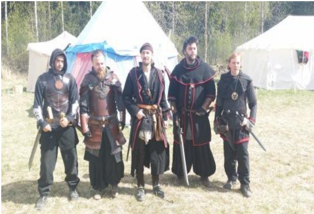
The Dirty Pants Gang

The party will also be met by members of the local nobility. These men will have the funds available to give to the party if they have defeated (and have proof) the Dirty Pants Gang. The celebration will go through the night and the PCs will be allowed to stay the night in the Dancing Maiden. In the morning a grateful alchemist will present them two Potions of Extra Healing as a reward. The party will thanked profusely and each will be given a “care package” of homemade meals on their way out of town as well.