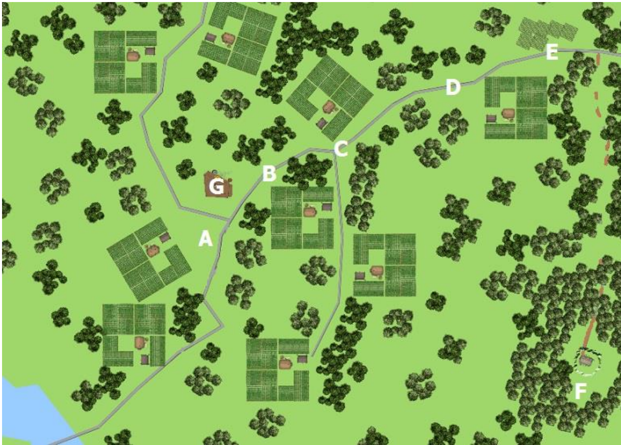
DM Area Map <above> Baby Chick size <below>